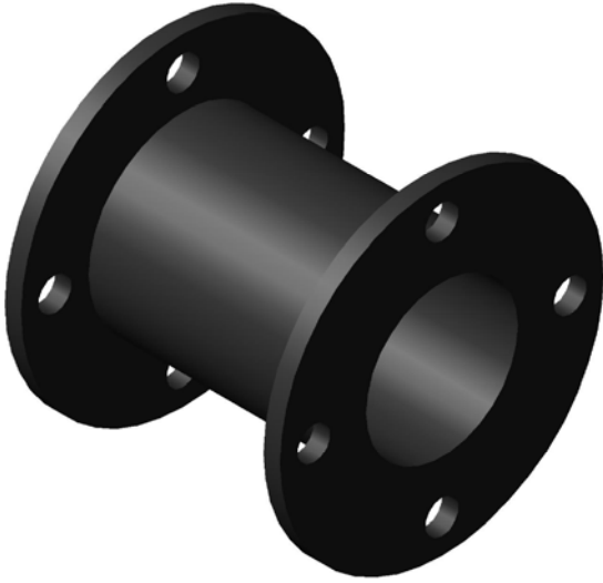
GR-1441 To GR-1451

G.R.BOND Rubber Bellow are manufactured in superior grade of NBR and Natural Rubber. Rubber bellows are manufactured in different sizes, shapes and lengths for various uses depending upon the fitment application. Rubber Bellows are used for absorbing vibration & shocks in pipe lines. Rubber bellows are flexible type and have good cushioning properties.